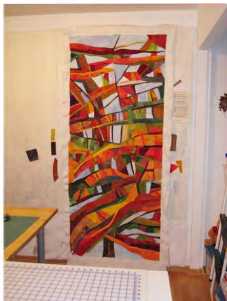
March 29 -- on the batting and ready to quilt. Studio tables cleaned off and ready for final steps, with not