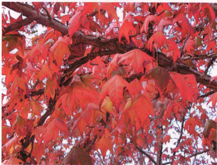
Inspiration -- leaf shapes