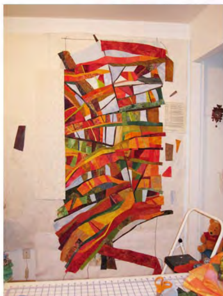
March 22 -- starting to come to grips with the top