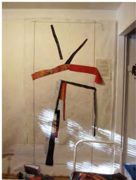
January 28, late afternoon. The extension to the bottom of the design wall is completed. I started blocking out main shapes in the late afternoon.

I had to first extend my design wall, because it wasn't tall enough to accommodate a quilt of this size. I outlined the finished dimensions of the quilt with red yarn pinned to the wall, so I could see the whole shape from the beginning. I usually do this later in the process, because the shape and dimensions emerge as I'm working on a quilt. In this case, since I knew what the finished size had to be, it helped to have it clearly blocked out. My studio is small, and I had to rearrange my work tables, so they didn't block my view of the design wall.