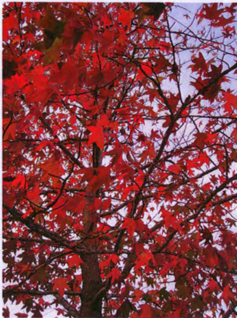
Inspiration -- structure

I knew I wouldn't be able to start working on the quilt until sometime in the new year, 2012. In preparation, through the autumn of 2011, I took photos of the liquid amber trees in front of my house, to document the changes in color and shape. These are the three photos I referred to while creating the quilt.