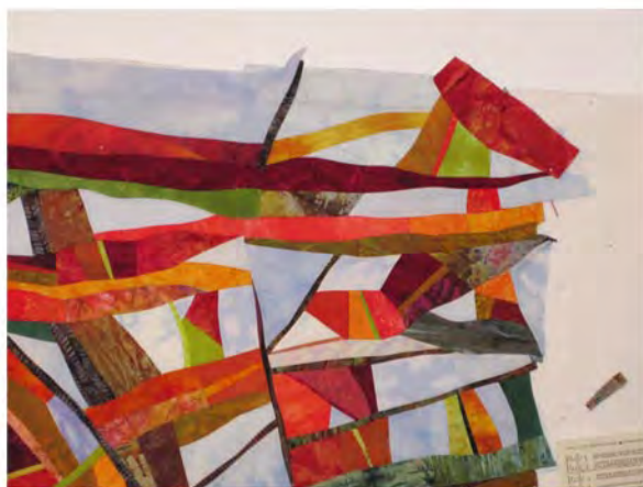
March 26 -- Detail of top right section