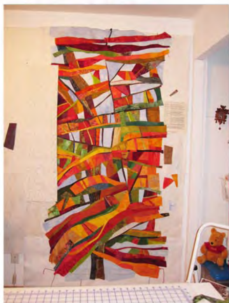
March 25 -- finishing up the bottom right corner