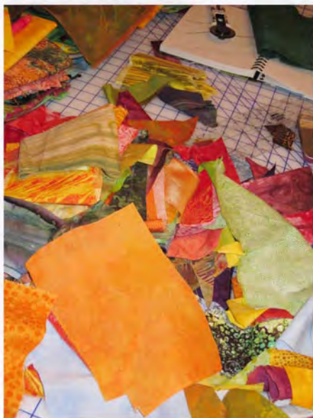
Work table 2