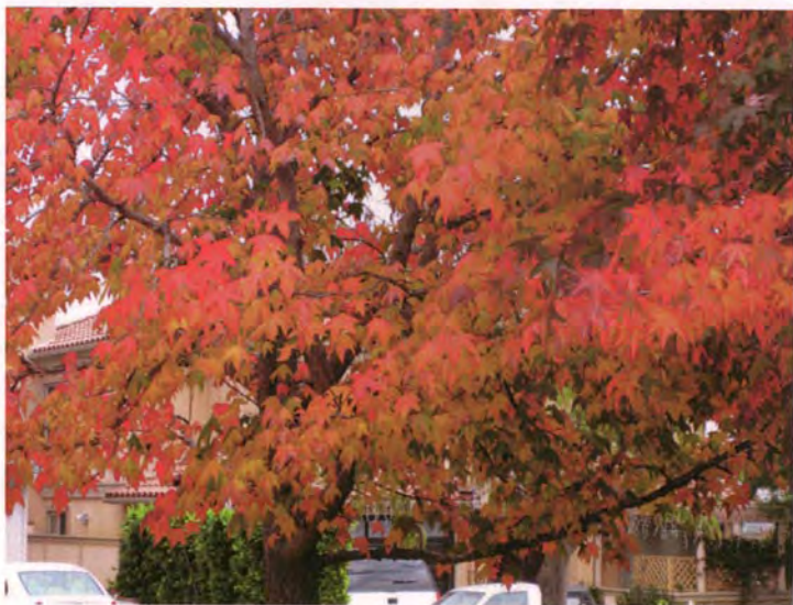
Inspiration -- color