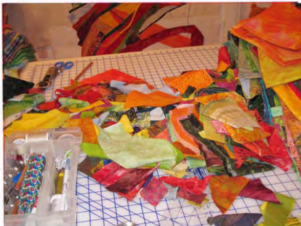
Work table 1