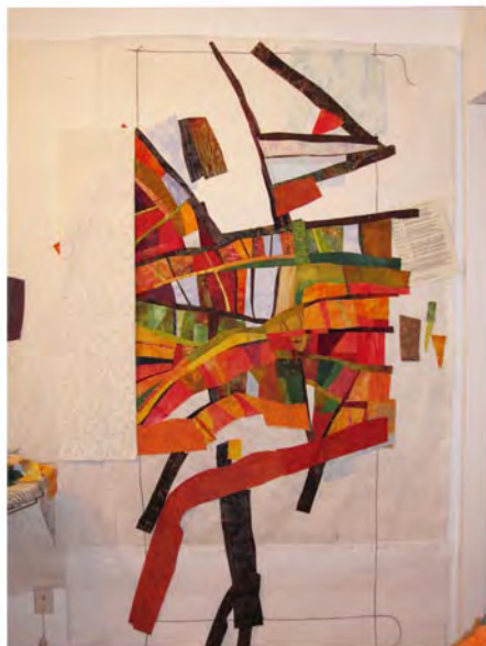
February 24 - The uneven edges were bothering me, so I placed a piece of fabric along the left edge so I could see one straight side.